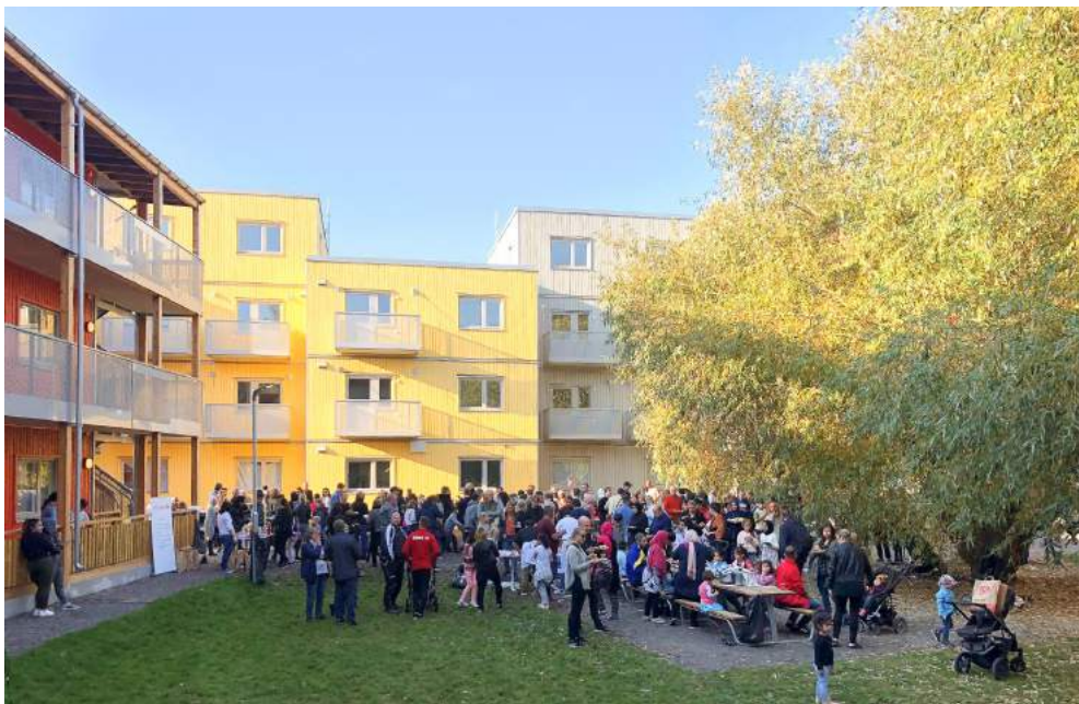
The opening of temporary modular homes for newcomers in Stockholm in 2018.

The foundation helps the tenants with the relocation to permanent housing solutions, also through a cross sectoral "Boskola - housing and living school" including notions concerning the economic aspects (rent and payments' deadlines), the application for a permanent house, the connection to the labour market, the link between family and school, safety and security and the general rules of co-habitation, supporting the process of inclusion of newcomers in the local system.