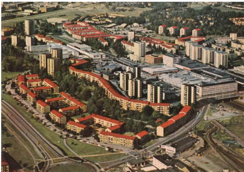
Historical postcard: aerial view of Vällingby showing the different housing typologies aggregated around the central hub gathering urban services and cultural facilities

Pioneering the 'ABC-Town' concept, Vällingby was planned as an integral, sustainable ensemble of public services, local workplaces, private enterprises, a varied architecture and housing typologies and careful landscaping with the ambition to transform a tabula rasa into a real town. It included all facilities required for a happy and modern life based on the ideal of equality aimed at eradicating poverty and inequalities (whether they relate to social economic, ethnic, or religious or physical conditions).