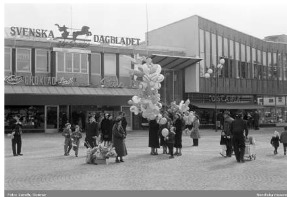
Historical image of Vällingby Centrum in the 1950s

Source: Nordiska Museet (ph. Gunnar Lundh)