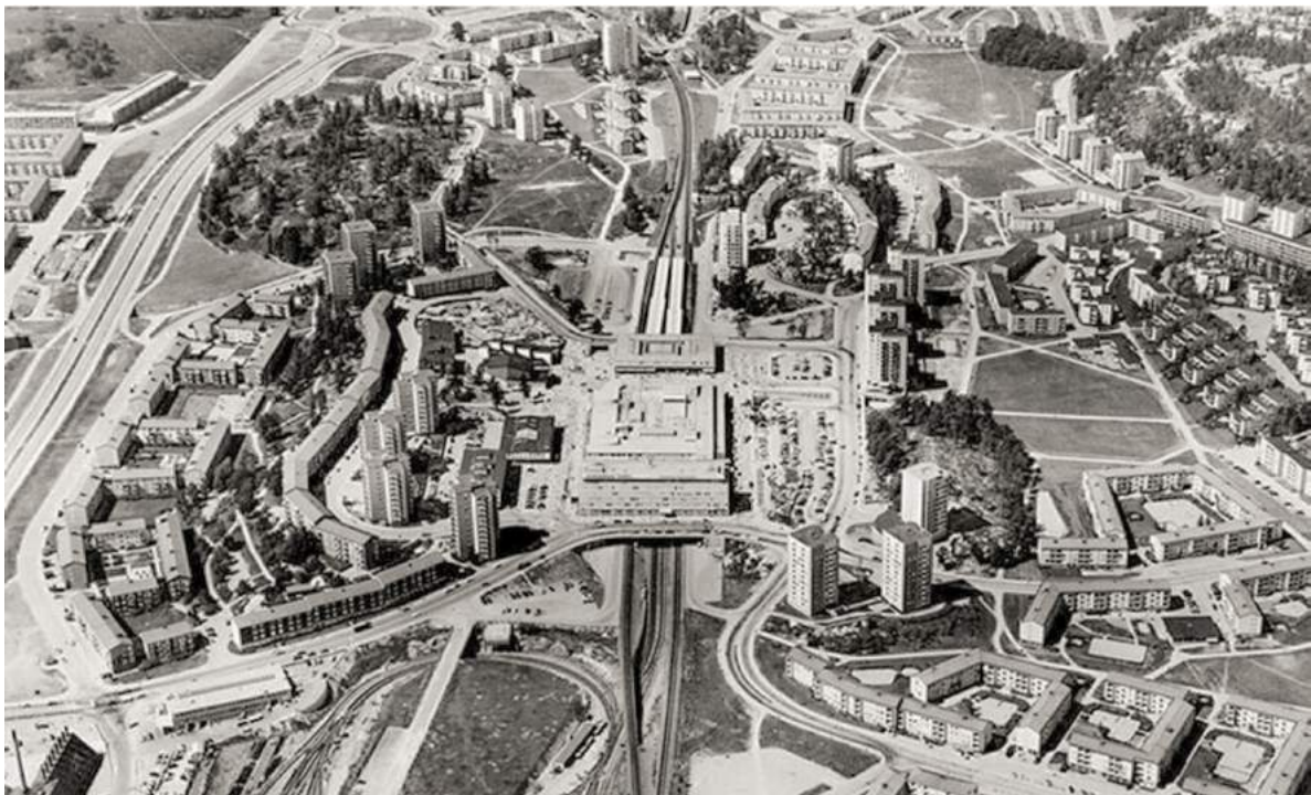
Aerial view of Vällingby centre and surrounding dwellings, 1958.

Vällingby was inaugurated in 1954. It was one of the satellite towns along the newly expanded subway line from Stockholm city centre to Hässelby in the westernmost part of the municipality. Vällingby was an ABC-town, which stood for Arbete, Bostad, Centrum (Work, Dwelling, Centre). The ABC model was developed from the concept grannskapsenhet or Neighbourhood Unit – an idea originating with the American planner Clarence Perry in the 1920s. Just as most modern New Towns the notion was that a good city should be based on semi self-sufficient neighbourhoods that each contained the very basic services needed for daily life within a walking distance. With dedicated schools, shops, post and bank offices, social services, and more, the neighbourhood unit would create a community and provide a sense of belonging and security for residents. The concept had previously been used to plan Årsta in southern Stockholm in the 1940s, and it was scaled-up and broadened in Vällingby, especially to expand the number of local employment opportunities. Vällingby was planned to accommodate between 25,000 and 30,000 inhabitants, who were imagined as socially and economically independent from central Stockholm and the surrounding urban areas.