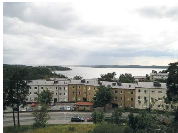
The abundance of nature and green spaces (in Grimsta on the left) and apartment-houses in Hässelby Strand with view on the lake (right)