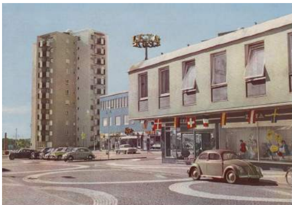
Vällingby in Postcards