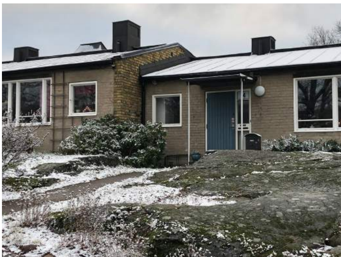
Row houses in the neighbourhood Atlantis, Vällinby.

Behind the new self-built housing developments, there was the utopian spirit of the New Town of Vällingby, the ambition of being in the midst of creating a new society. A model for ideal communities was being tested, supported by a package of tools and special loans which also included the possibility for the residents to pay in workforce (they built in their own free time and weekends). Priority was given to families with children and works had to be realized with a quite high pace (9 months to build the house). The result was a low-cost solution with high quality standards, in terms of architectural spaces, and strong connection with the natural environment.