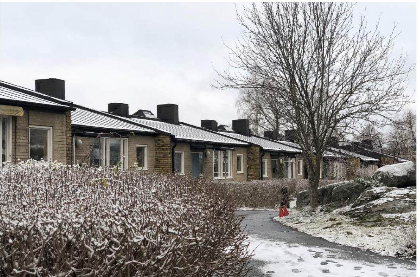
The neighbourhood Atlantis, Vällingby Photo: Will Cousins, 2019

Adapting the welfare state model to present needs. The ABC-Town in transition