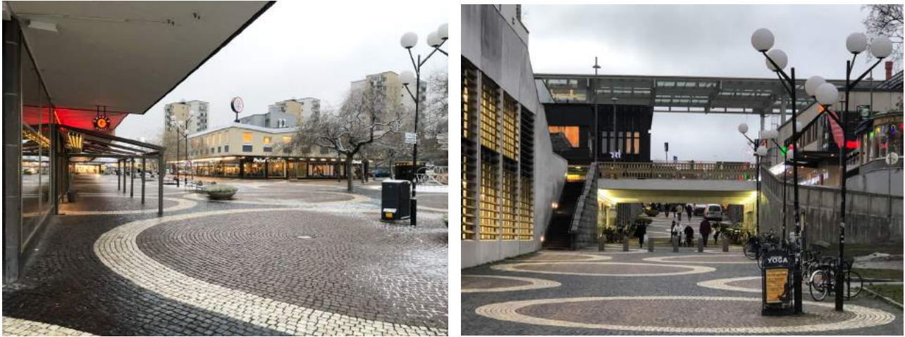
View on the central pedestrian areas of Vällingby-Centrum in December 2018; and the commercial area Vällingby -Centrum recently renovated on the right.

Along the same line of thinking, the Hässelby-Vällinby district has commissioned a photographic research to explore the city's new hybrid culture which is to be detected and somewhere hidden within the welfare social and cultural infrastructure of the city of 1954. "Hidden diversity" was exhibited in the People House where the lab was held and portrayed the ongoing transition from the A-B-C town to the contemporary city demographic composition.