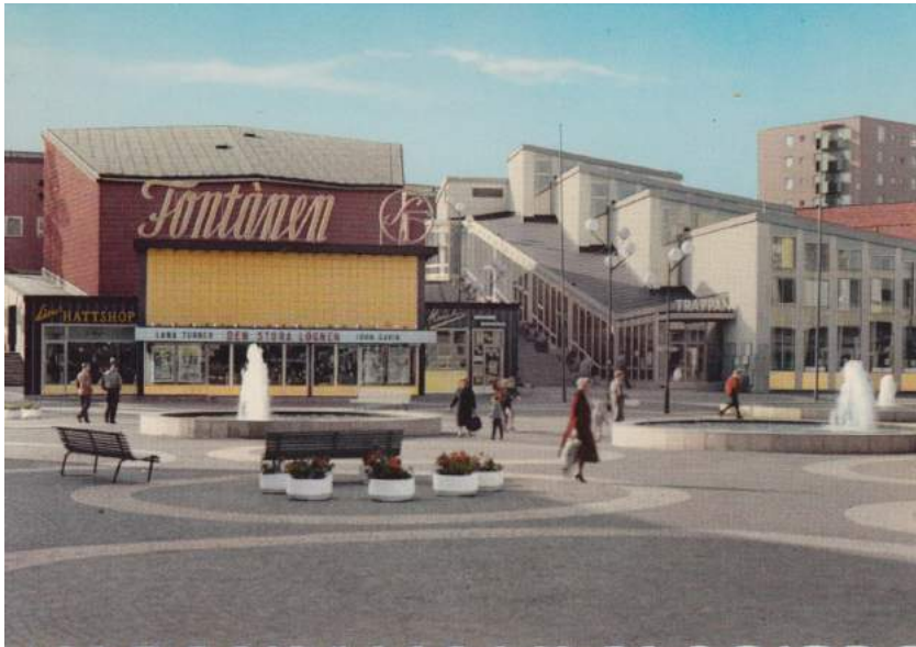
Vällingby in Postcards: The Theater Fontänen.

In Vällingby, Svenska Bostäder has recently restored the façade of the iconic cinema Fontänen built in 1956 with an operation which, by completely transforming the inside (addition of several new screen-rooms) is unnoticeable from the outside.