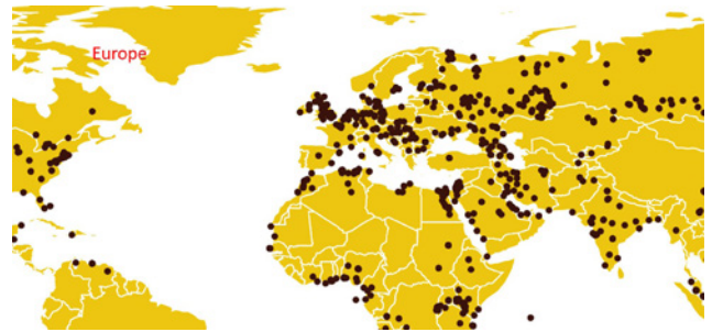
INTI database, Eastern and Western New Towns

In the last three years, INTI decided to focus on Europe, where many pressing issues are at stake (such as climate adaptation and migration) that address urban transformation. Within that context the post-war European New Towns have the same age and share the same characteristics and DNA, because they are developed in the same era. Therefore they show the same challenges. Unlike other cities, the New Towns have to renew themselves as a whole, on a large scale, after 50-60 years of age. This applies not only to Western European New Towns, but also to Eastern European New Towns, although they originate within different regimes and political systems.