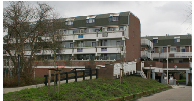
Neighbourhood Buitenwegh, Dwellings located on decks, with parking below

that were built in the seventies, like the elevated housing blocks with parking downstairs and living at first level.