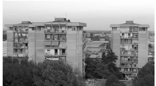
Fragment from the film The Artifice

Some of the voices of Milton Keynes have mentioned: Minorities find it hard to cross out thresholds, 'it is not enough to have something put up. Invite us!' How inclusively do we plan our New Towns? 'Whose city is it?'