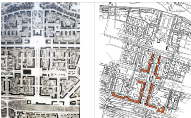
Plans of protected heritage Dimitrovgrad

Aneta recalled a story that in late 1980s the local journalist Dimitar Beremski made a bet with a fellow colleague from Deutsche Welle that wherever you live in Dimitrovgrad, you live in a park. The German did not believe him and... lost the bet. Indeed, one can walk the town from north to south and from east to west only through green areas and parks. All the residential blocks, even the much later additions of prefab districts, are placed within generous green spaces with mature trees, flowers and pedestrian alleys. Dimitrovgrad is perhaps the only non-stop garden city in Bulgaria.