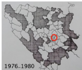
Area development analysis