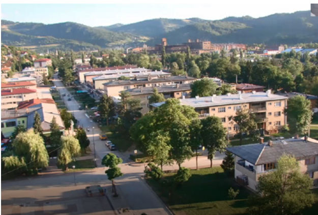
The landscape surrounding Ilijas

Ilijas is a town that started as a satellite of a capital and slowly has been assimilated and transformed into a suburb of Sarajevo. Now it is developing to become a suburb, assimilated by the ever-growing Sarajevo and adapting new functions. It is a city that uses its nature and context to continuously build on its historical values. As shown in the presentation and based on the reactions of the event audience, the green landscape has always been an asset of Ilijas and, as Michelle observed, nature occupies a quarter of the image on postcards from the Olympics. This resource is valued by the inhabitants of Ilijas and visitors alike, transforming the perception of the New Town in a positive way. This green quality can become a new theme that can be developed and explored through the INTI network, through the reinvention of green and landscape.