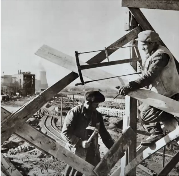
Dimitrovgrad being built