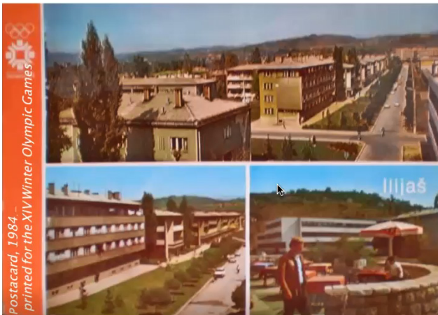
Olympic postcards Ilijas