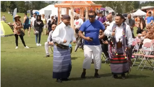
MKIAC Art in the park event