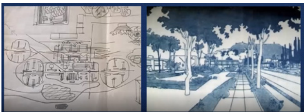
Nova Gorica drawings

trigger different relationships with the local history, reshaping the collective memory and creating a space for reflection on what the heritage of the young city is. Theory and practice will be connected in the project with a focus on youth involvement and heritage. The involvement of young people next to others stakeholder groups like scientists, experts, local politicians, local entrepreneurs and local people, is essential in the future development of the city and any initiative related to it. This is being achieved through an approach in which the different communities of the town explore how to use their personal memories and experiences to the benefit of future urban development. This is sustained by the theoretical approach of researching the importance of modernist heritage based on ethnographic methods. Through observation, interviews, roundtables, and intergenerational debates, with old people talking about their experiences of how they built the New Town, and young people telling why they like to live in Nova Gorica.