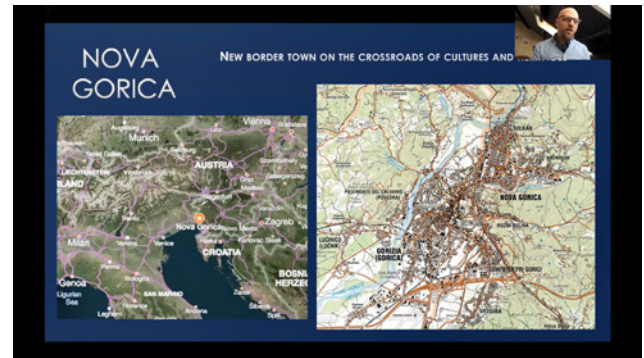
Nova Gorica Border

As a result of a border dispute, the decision was made that Gorica after the World War II became part of Italy and was called Gorizia from then on. But 2/3 of the region of Gorica became part of Yugoslavia, so a new centre for this area was needed. Not an extension of an existing town, but a New Town that will shine over the border: big, beautiful and proud, a socialist showcase for the West. The ideological decision was made in Belgrade and Nova Gorica became the first New Town built in Yugoslavia. Edvard Ravnikar was the main architect and urbanist in Yugoslavia in that period and he designed a modernist CIAM-like plan for the town. Ravnikar was influenced by Le Corbusier. Nova Gorica was planned to be built in five years, with housing for 10.000 people. Youth brigades, youngsters from all over Yugoslavia, came to Nova Gorica to start building the town in 1947. But when they started with the first building, the project was stopped immediately, because Yugoslavia was kicked out of the Soviet Union by Stalin: Tito became too powerful. Because of this decision the ‘Iron Curtain’ was not located between Italy and Yugoslavia anymore, so the idea of a socialist showcase shining over the border was not needed anymore. Instead, a good relationship was needed with the West. Nobody wanted the New Town anymore, so already from the beginning Nova Gorica had a problem with