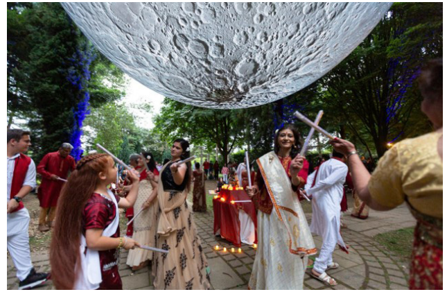
Indian Lunar festival held in Milton Keynes