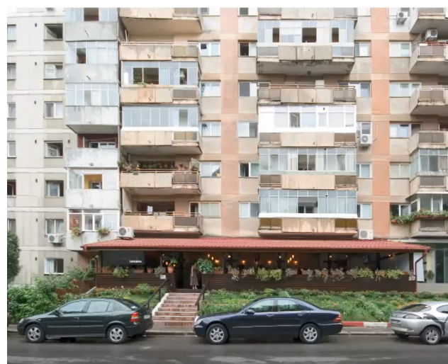
Typical modernist housing blocks of the Khrushchev era and later in Eastern European cities

Nova Gorica, Milton Keynes, Zingonia and Dimitrovgrad have displayed multiple facets of this subject, from integration of minorities, to the recognition of the minority groups as essential parts of the city culture and to the celebration of this multiculturalism within the spaces provided.