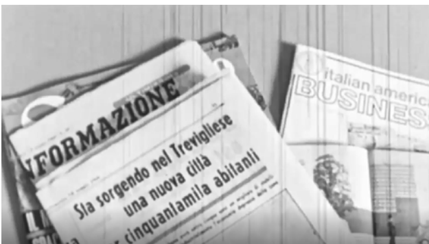
Fragment from the film The Artifice

The Artifice is a poignant short film, a piece of art showing the rough and unpolished lives of the inhabitants and of migrants in Zingonia. The issues presented are redevelopment and the relocation of local inhabitants that resulted from that, the six towers that are known for large numbers of minorities and alarming crime rates and the estranged feeling that the locals have while being resilient to their environment. The heritage is comprised of multiple facets of the same wish to belong, to be accepted and to integrate.