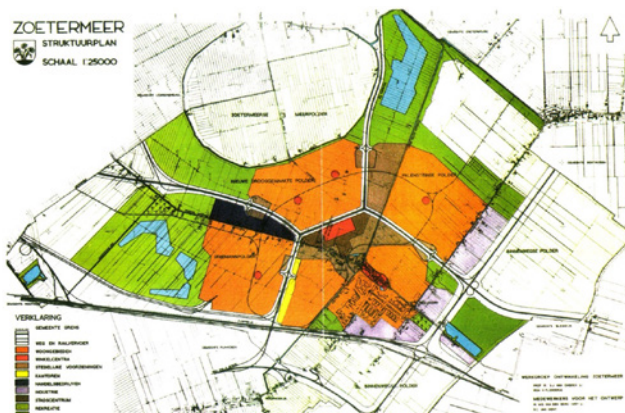
Structure plan Zoetermeer 1968

In 1968 the Structure-plan was developed by the Workgroup Development Zoetermeer and the New Town has been developed according to this plan until today. It consists of an H-structure of parkways, with the new City Heart in the centre, surrounded by residential areas. The huge green areas that are part of the plan determine the identity of Zoetermeer as a green city: every neighbourhood has its own green areas, connected also to the countryside immediately outside of the city. The green identity is important within the heritage and identity of the New Town.