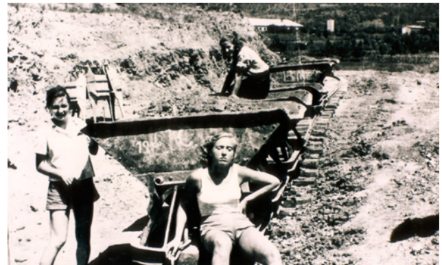
Young brigades building Nova Gorica